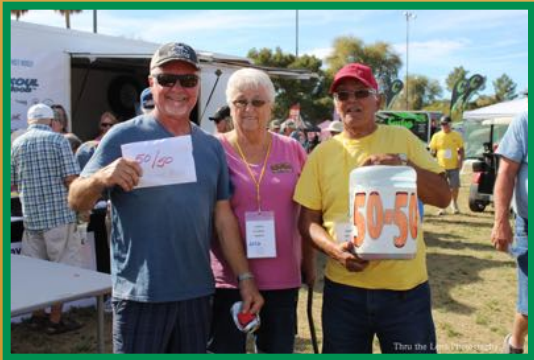
"Big Winner" Hot Rod enthusiast won $1,378 at the Havasu Hot Rodz Car Show on Saturday