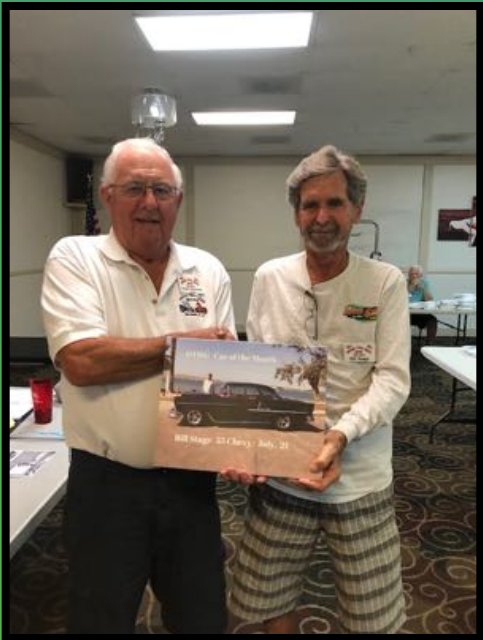
COM July 2021 Bill Stage 1955 Chevy