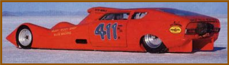
Click on the link to watch Betty Burkland (Land speed record holder) in action Betty Burkland