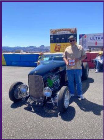
Crossroads Car Show Date: April 6th