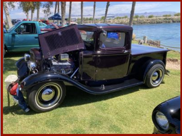
River Cruizers Hot Rod & Harley Show Date: April 18th-21st