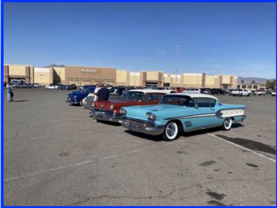
Shriners All Club Charity Cruise to Oatman Date: March 27th