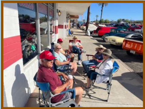
Car Cruise for History Date: April 12th