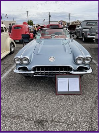
Brad Lano won open Roadster Corvette Class for Best in show

25 OTHG members showed up at the Troop Box Convoy along with 300+ others cars. OTHG will receive 2nd place participation award