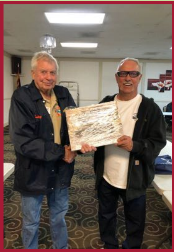
Bruce Hall Car of The Month December 2020