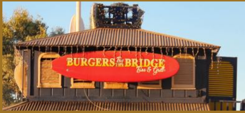
KRUZE to Burgers by the Bridge DATE: Nov 17, 2020 21 members attended