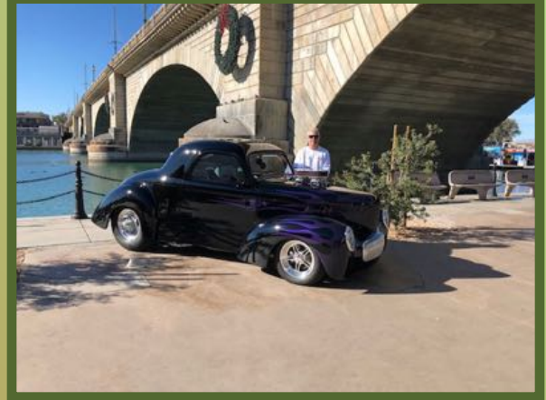
1941 Willy's Coupe Blown 392 Hemi COLOR: Black